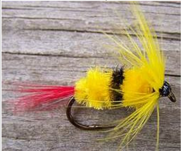
Photograph by Romeo R