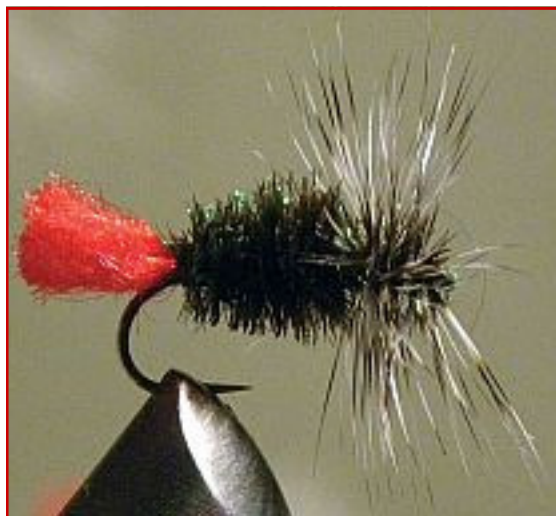
Hexe tiemco - Tiemco 5230 # 14