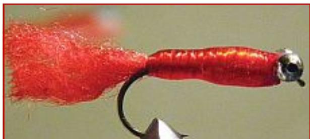
Red mini streamer - Tiemco 5230 # 10