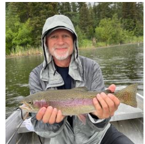
Rob Jensen Education

There will be a joint casting session with SSFF (South Sound Fly Fishers) on Saturday, September 12 at 10:00AM at Tumwater Historical Park, (802 Deschutes Way SW, Tumwater, WA 98501). This session will be open to all who want to work on their casting technique, even if you are not interested in the FCSD program ( FCSD LINK ).