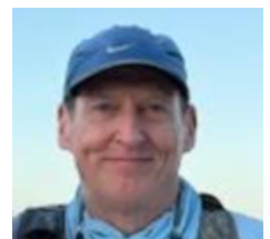
Steve Knowles Conservation

They describe a number of completed and active projects supported by TU across the state. As with most of our NW conservation organizations, they strive to make it easy to get involved and make a difference. For more information, sign up on their “Every River Needs a Champion” website .