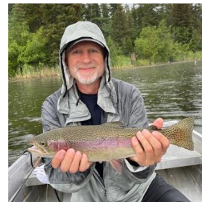
Rob Jensen Education

There is newly established Fly-Fishing Education Hub Group on our website. There you will find links to an archive of outings information sheets, the complete course material for the beginning fly fishing class, useful links to education resources, and copies of previous club presentations. Check it out!